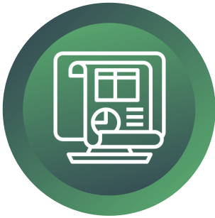
Self-Serve Portals for Your Partners