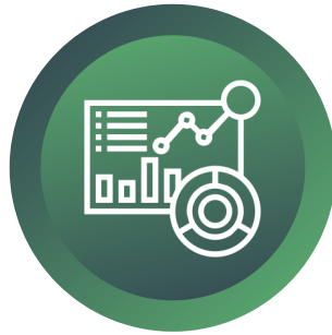
Automated Invoices and Payments