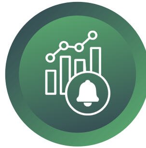
Easy Parking Validations